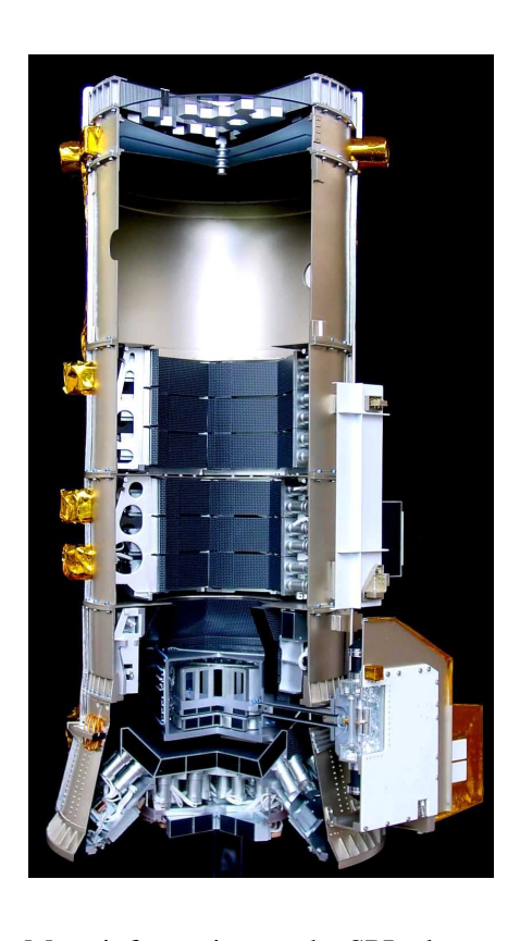
Figure 1: The instrument view

The SPI telescope is based on the association of a coded mask and a gamma camera. The detector plane consists of 19 hexagonal crystals of high purity germanium operating at 80 K.