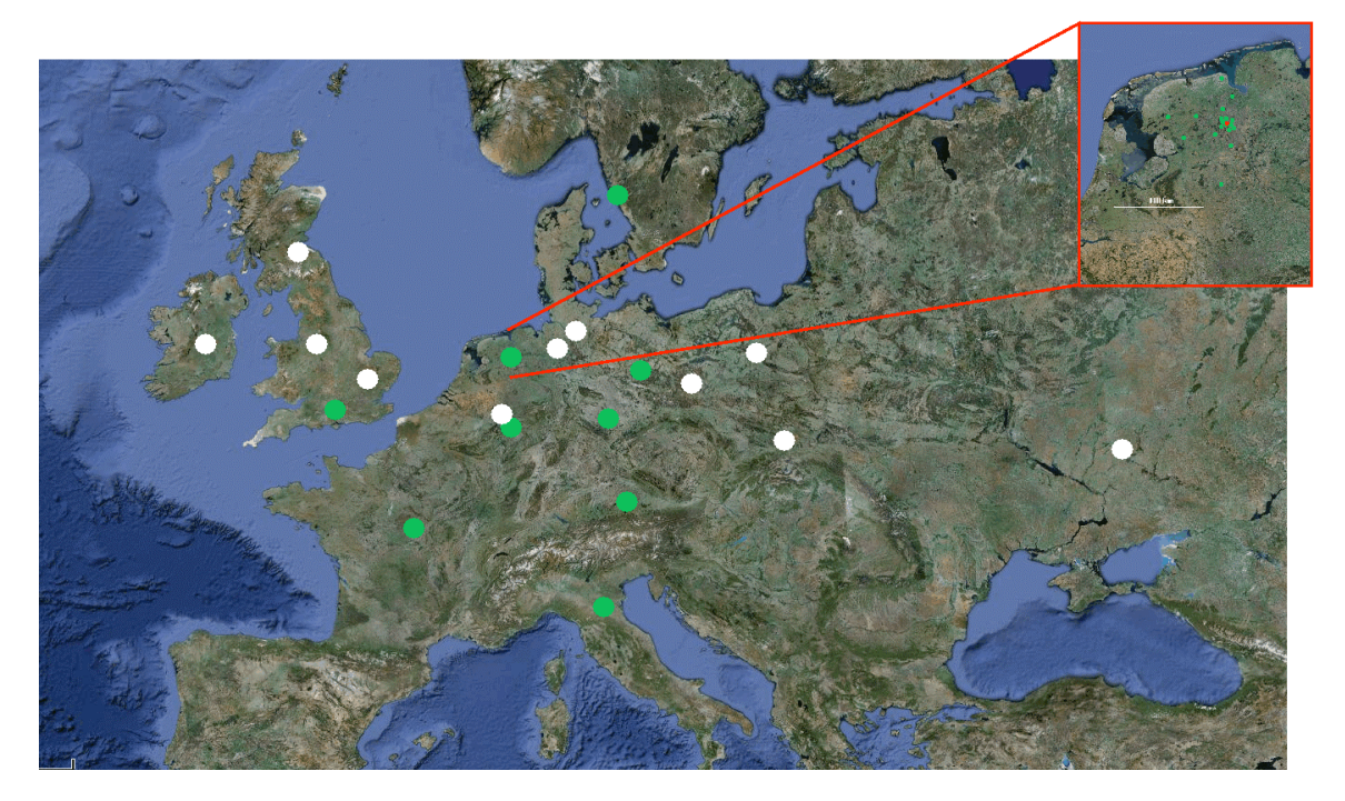
Figure 1: The location of LOFAR stations in Europe and in the Netherlands. Green dots represent stations where funding is secured or for which letters of intent have been received. White dots represent stations that are planned by the various international consortia and for which funding is being sought. The location of remote antennas in the Netherlands is shown top right – the red dot shows the location of the central core stations in Exloo.

longest baseline within the Netherlands is \sim 100 km. At least another 8 stations will be located in 4 other European countries – 5 in Germany, and 1 each in Sweden, France & the UK. There is also significant interest in Italy, Poland, Ukraine and Ireland, but these stations are not yet fully funded. The physical distribution of stations (including potential stations) is shown in Figure 1.