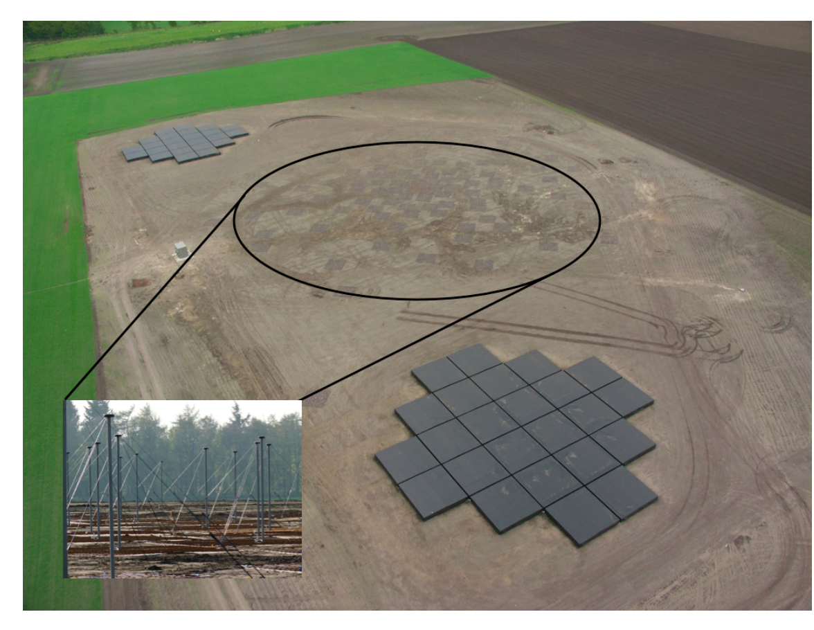
Figure 2: The first complete station CS302. This station lies about 2 km from the super-core (see Figure 3).

field of view, ushers in a new era for radio astronomy. In addition to the study of transient phenomena, the LOFAR Key Science Programmes (KSP) include: deep, wide-field extragalactic surveys; exploring the epoch of re-ionisation, and cosmic ray detection. Both the survey and transient KSPs are likely to discover many interesting phenomena that will require much higher-resolution observations with e-VLBI. When completed in 2010, the full LOFAR array will have a sensitivity and resolution that is \sim 2 orders of magnitude better than anything that has preceded it, and will open up one of the last unexplored frontiers of observational astronomy.