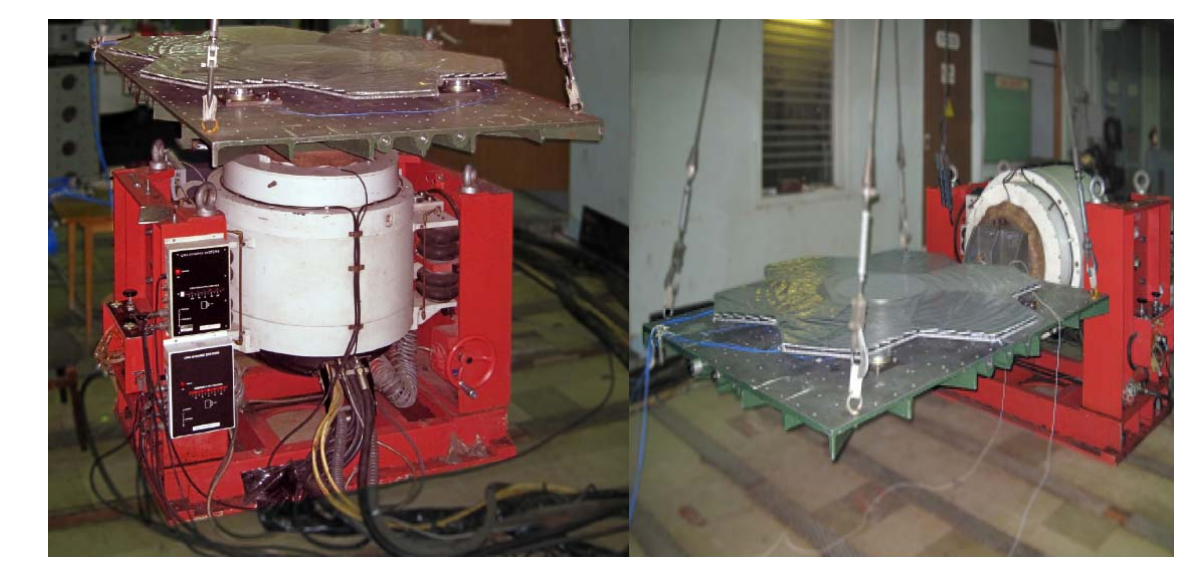
Fig.2. Space qualification tests of the technological Fresnel mirror

A set of the program packages for TUS are producing including the event simulation with expected optical parameters, programs for on-board data processing and off-line physical analysis. A special attention is given to measurements of the Fresnel mirror system for an evaluation of systematic uncertainties in the data.