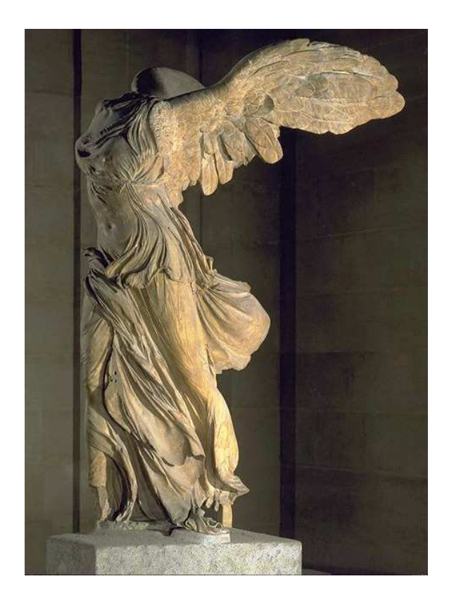
Figure 2: The Winged Victory of Samothrace at the Louvre Museum: a metaphor of the long quest for finding and piecing "fragments" of new (neutrino) physics.

constructions of the underlying picture, and long timescales for major achievements. The neutrino talks presented at this Conference represent very well both the extraordinary progress and the great challenges inherent to this field of research, as briefly reviewed in the following.