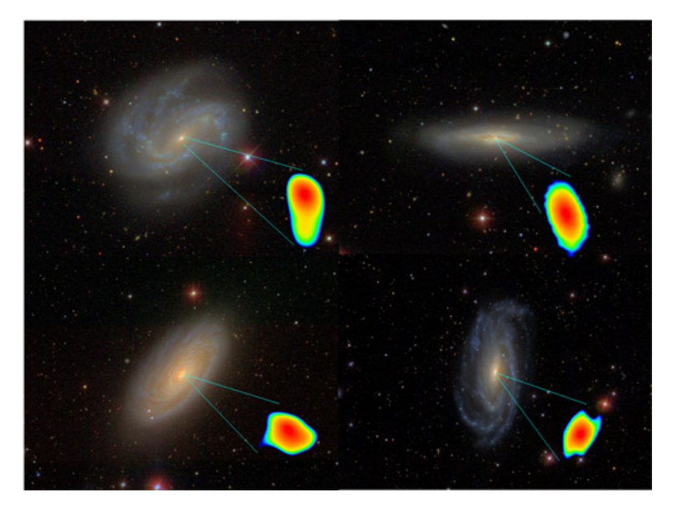
Figure 1: Combined optical and EVN images of Seyfert galaxies. Clockwise from top left: NGC 4051, NGC 4388, NGC 5033, and NGC 4501. Optical images from Sloan Digital Sky Survey, radio ones from EVN observations at 1.6 GHz ([3], typical beam 10 \times 5 mas).