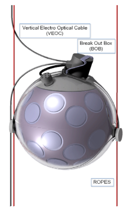
Figure 2: A drawing of the DOM connected to the string structure

Eighteen DOMs will be connected in a vertical string structure called Detection Unit (DU). Only one electro optical cable runs along the string structure carrying the optical fiber for communication and the mid voltage (375 V, down converted to 12 V in the Break Out Box) used to supply all the DOMs in parallel.