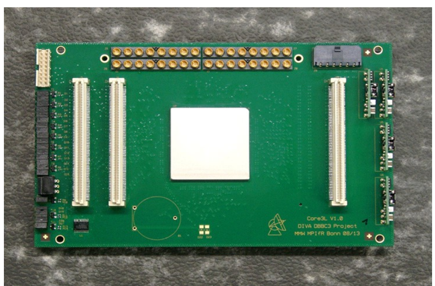
Fig. 3: Prototype of the CORE3-L board. In the centre the FPGA can be seen. The connectors for the high speed buses are visible on the left and right side. On the top are two rows of additional input connectors.