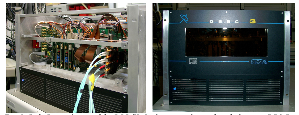
Fig. 5: Left: Internal view of the DBBC3. In the centre the stack with the two ADB3-L and CORE3-L can be seen. Right: Front view of the DBBC3.

The ADB3-L sampler is capable of operating in the first Nyquist zone, which for our purposes is limited to 4096 MHz. In order to adapt the back end to different receivers/IF systems having an output in a pretty variable range, and at the same time to be able to process the full VGOS band covering the range 2-14 GHz, an additional unit has been developed, named GcoMo. It processes the input band limited to a maximum of 4 GHz to the first Nyquist zone in a very flexible way. This card can also adapt the analogue signal levels to what is required by the ADB3-L. This includes automatic gain control (AGC) or manual gain control and allows to perform total power measurements of the incoming signals. A complete prototype has been developed and debugged, and is now on its way to reach the production stage.