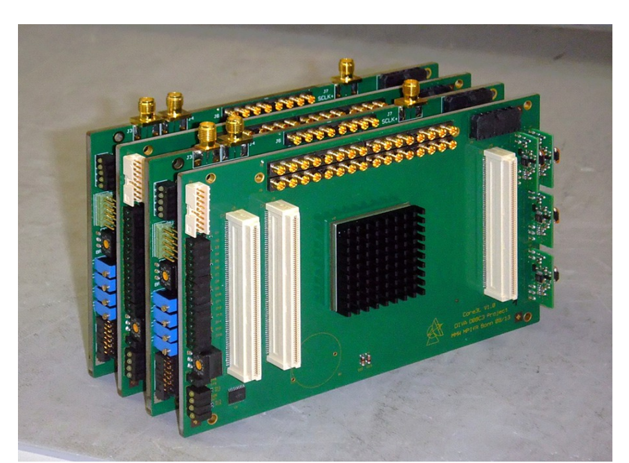
Fig. 4: Stack of two ADB3-L and CORE3-L for processing 4 GHz of bandwidth are shown as used in the DBBC3