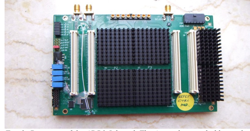
Fig. 2: Prototype of the ADB3-L board. The 4 samplers are hidden under the 4 heat sinks in the centre. Four white connectors for the high speed buses are on the left and right side.

This board (see Fig. 2) has been designed, tested, and is ready for further development of firmware and testing till the production version can be released.