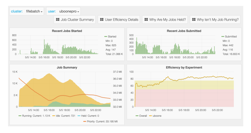
Figure 3: Screen capture of an overview page in FIFEMON. Upper left: jobs recently started. Upper right: jobs recently submitted. Lower left: overview of user jobs vs. time, categorized by job state. Lower right: total efficiency for all running jobs, calculated as CPU time divided by wall time since job start. There are also links in the upper right that go to pages explaining the reasons that any jobs have been held, and compare available job slots to your jobs' requirements to help understand why jobs are not starting.

Based on experience with FIFEMON, similar technologies are being used in the Open Science Grid's next-generation accounting tool, GRÅCC [10]. This tool, intended as a long-term Gratia replacement, will provide the same information to service providers and users as Gratia does, but with an improved UI and a lower support burden.