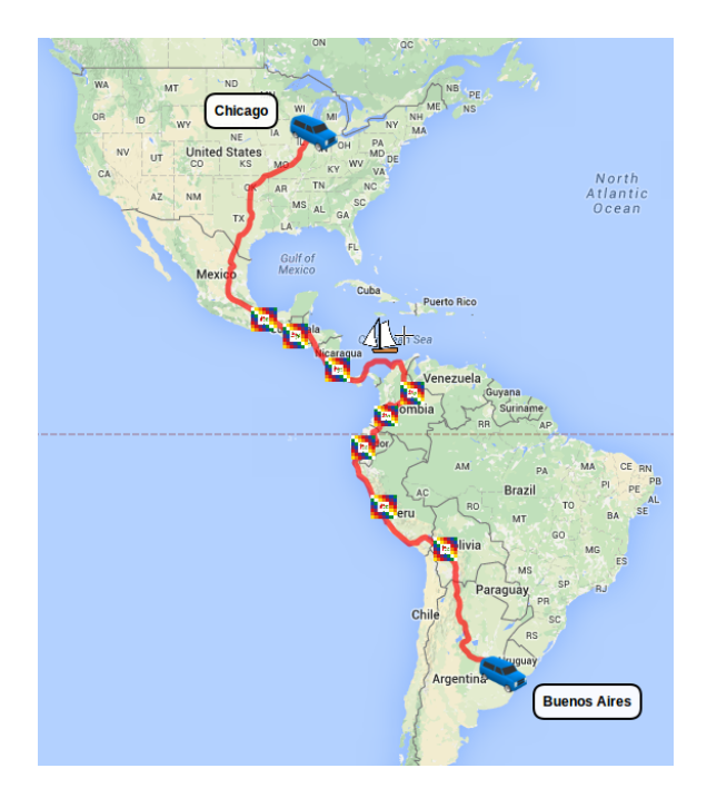
Figure 1: Map of the courses and the route followed.

The instrumentation schools organized in Latinamerican countries over the past decades (e.g. the ICFA instrumentation school series) have shown an increasing interest in Particle Physics detection technologies in the region. The strengthening of the participation of groups in experiments at first-class international facilities (such as CERN, Fermilab, Pierre Auger Observatory, etc.) and a thriving cohort of young Latinamerican experimentalists in the field is a clear accomplishment of those efforts. Detector and instrumentation schools can be a pivotal experience in the career of a student. Hence, aligned with these endeavors, we organized and lectured a series of them in the way of a drive from Chicago to Buenos Aires: the Escaramujo Project<sup>1</sup>.