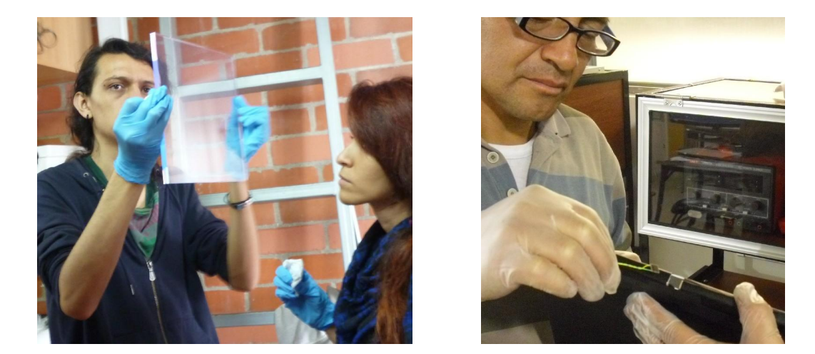
Figure 4: Left: two Physics student cleaning a scintillator plate before wrapping. Right: Professor Jaime Betancourt (Universidad de Nariño, Colombia) coupling the SiPM to the scintillator.

records the arrival time of the leading and trailing edges of the discriminator output, with 1.25 ns resolution. The CPLD allows the user to define the trigger logic (1- to 4-fold coincidence), record scalers of single channels and coincidence counts, define the discriminator thresholds, window gates, among other functions. When a trigger is fired, the system generates an event that contains the times of all the edges within the window gate referenced to a global timestamp. The DAQ card is powered with 5 V DC and has a 5 V fan-out connector to bias other devices.