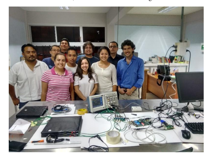
Figure 2: Participants of The Escaramujo course at the Universidad Autónoma de Chiapas, México, with the detector in the forefront.

laboratories and a minimum of equipment (oscilloscope, gloves, etc.). A map showing the visited institutions and the routed followed can be seen in figure 1. Figure 2 is a picture of the participants of the Escarmujo course at the Universidad Autónoma de Chiapas, Mexico. Table 1 compiles the information of the visited institutions, courses dates and local organizers.