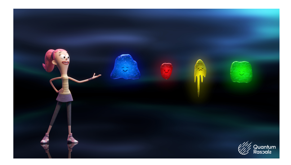
Figure 2: The four forces of the Standard model of particle physics. From Quantum Kate: The Standard Model [2].

Fashion, like physics are two of Quantum Kate's main interests, and she is super happy to share her knowledge of physics with her followers. She introduces them to the quantum world as well as black holes, stars, dark matter, the standard model of particle interactions, etc. These are concepts that are considered hard to communicate. Quantum Kate's starting point is often taken from her everyday life. In about one minute she introduces us to the amazing wonders of the subatomic world. Currently there are 17 episodes and two more will be released soon.