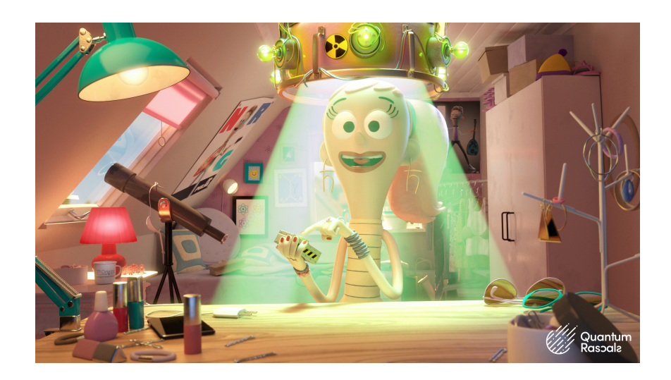
Figure 5: First time through the portal. From Quantum Kate: What atoms are made of [1].

• www.youtube.com/channel/UCokWdMzX-VJoP3UqlyEjPoA (Quantum Kate in English)