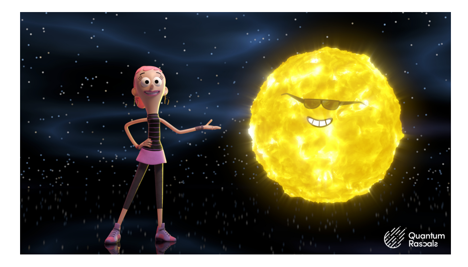
Figure 3: Do you know where the sun gets its energy from? Have a look inside the sun with Quantum Kate. From Quantum Kate: Sunshine [3].