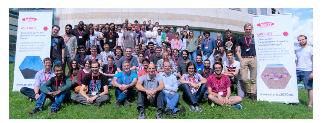
Figure 3: Participants of the second programming school in Annecy (France, 4-8 June 2018)

This work package has also been successful in producing common solutions for the ESFRIs. Software libraries were developed through creating bridges and cooperative links between the scientific communities, European e-infrastructures initiatives, other consortia and institutions provided state of the art expertise in data management and computing through a number of general workshops.