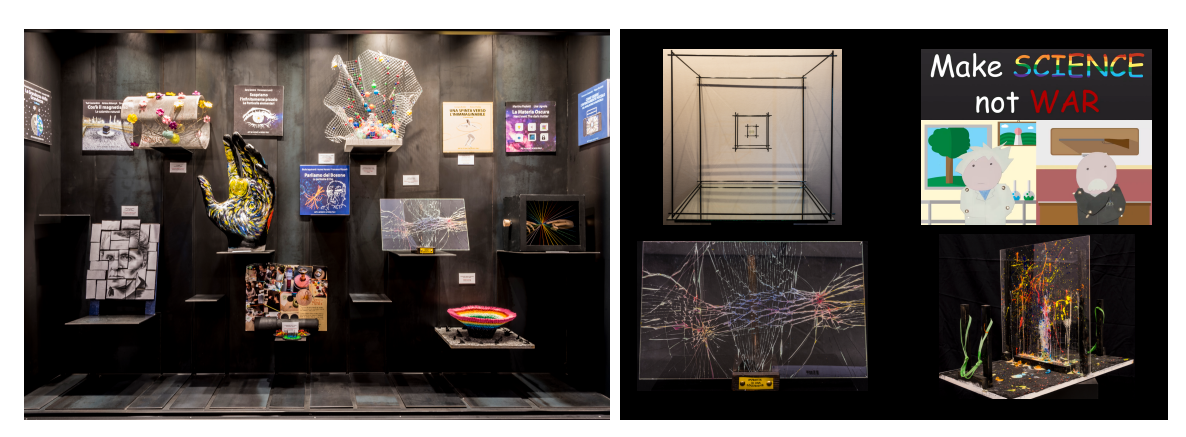
Figure 2: Artworks exposed at the national exhibition in Naples.

visited experiments, attended various lectures on the interplay between Art and Science and enjoyed the hands-on activities in the CERN's S'Cool Lab [5]: it was rewarding to observe their amazed reactions, mist of satisfaction and wonder, when they first observed particle traces showing up inside the little cloud chambers they had just assembled with their own hands!