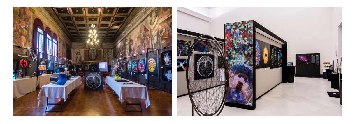
Figure 1: Left: local A&S exhibition in Padua. Right: national exhibition in Naples.