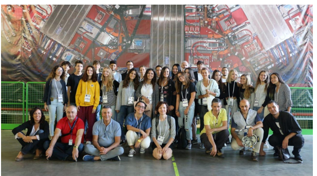
Figure 3: Images from the Master on Art&science at CERN. Left: hands-on session at the S'Cool Lab. Right: the group visiting the CMS experiment.