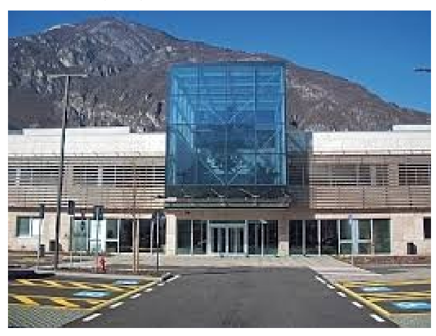
Fig. 2.1: The Trento Proton Therapy Center.

The Trento Proton Therapy Center (TPTC) is one of the only three medical facilities for hadron therapy operating in Italy. It is located in Trento and it is operated by the Azienda Provinciale Servizi Sanitari (APSS)[2].