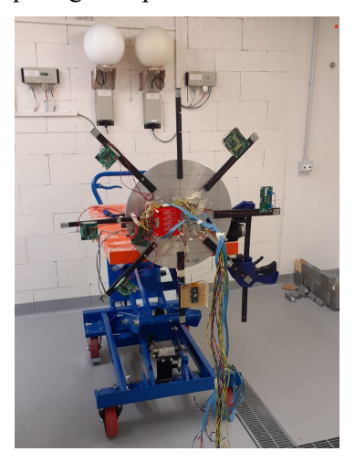
Fig. 2.6: The remote irradiation daisy with two neutron detectors on the back.

Since October 2020, thanks to the HERMES Bologna group, a new device is used for proton irradiation: the remote irradiation daisy, that allows to perform multiple irradiations remotely controlled without requiring the operators to enter the cave.