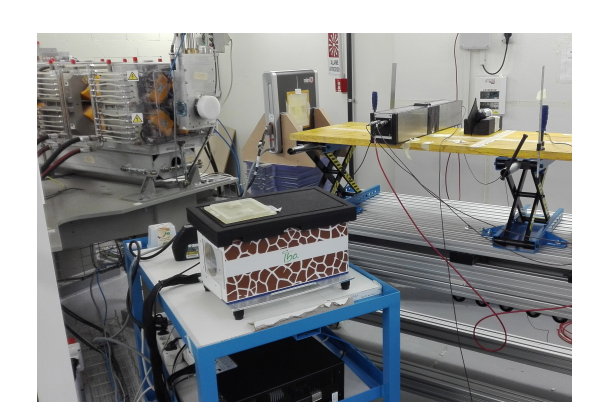
Fig 2.5: Biophysics (left) and physics (right) beamlines during the data taking.