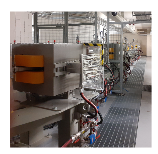
Fig. 2.2: The the cyclotron output point (left) and the beam distribution line (right).