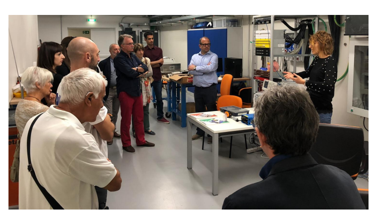
Fig. 3.1: Detectors exposition (left) and visitors attending the demonstration (right).