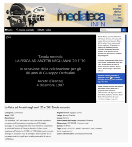
Figure 3. An example of a video with chapters on "La Mediateca INFN"

"La Mediateca INFN" has now 168 videos, lasting 76hours 8minutes and 48seconds, and they go from 1938 until 2018.