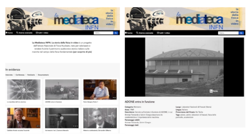
Figure 1. The homepage of La Mediateca INFN and an example of how a video is displayed

you click on a video, under the video player a short description is displayed, along with some information about author, place, persons in the video or mentioned, year, language and relevant keywords ( Figure 1 ). Videos are catalogued in five different categories: interview, newscast, conference, documentary, educational. It is possible to filter videos according to the selected category.