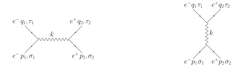
Figure 1: Feynman diagrams leading to the Coulomb potential in QED.

where Q and P correspond respectively to the final and initial total momentum and T_{fi} is the scattering amplitude, which can be computed through Feynman rules. There are two Feynman diagrams contributing to it, which are shown in Fig. 1.