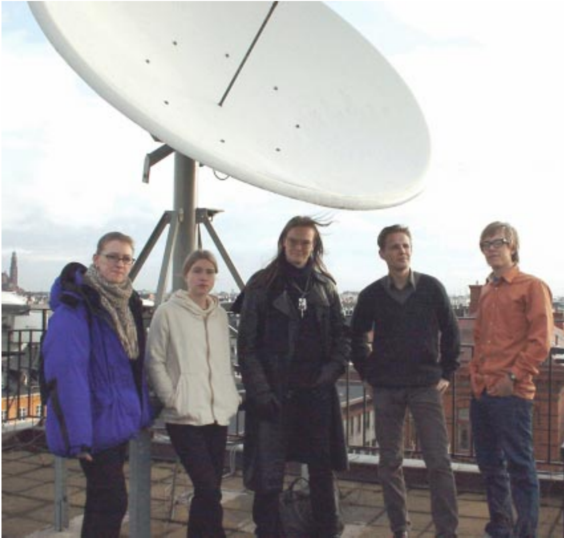
Figure 3: Students in front of the parabola antenna on the roof of Fysikum at Stockholm University.