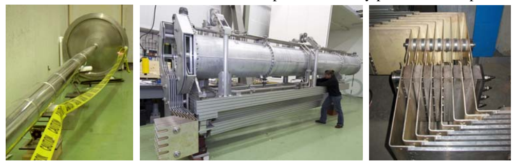
Figures 2a-c: CNGS horn inner conductor, assembled horn and horn-busbar connection.

A horn is a high-current, pulsed focusing device aimed at increasing the intensity and selecting the energy of a neutrino beam. A modern horn (Figure 2a-c) consists of a water-cooled aluminium inner and outer conductor, connected to a power source by parallel busbar plates.