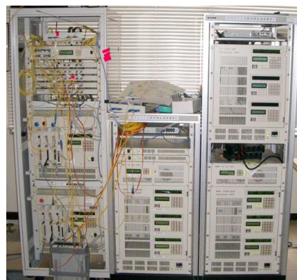
Figure 2: High speed hardware correlators with 2Gbps \times 6 baselines capability (center-right) and VLBI network adapter VOA-200 (left) developed by NAOJ.

Japanese VLBI activities are made up of contributions by NAOJ, NICT, GSI, JAXA/ISAS (Japan Aerospace Exploration Agency/Institute of Space and Astronautical Science), and Universities. Totally more than 15 VLBI stations are operated in Japan, although the number of telescopes connected by high speed networks is six at present (Fig.3). NAOJ has been conducting an optically linked high speed VLBI project. Astronomical VLBI observation sessions in 2 Gbps (1Gbps/2bit/1ch) have been performed by the subset of the six stations. NAOJ has developed a real-time hardware correlator with 4-station 6-baselines processing capability (Fig.2). A VLBI network adapter named the VOA-200 has four VSI-H interfaces for input and output of data streams, and it works as both a sender and a receiver of VLBI data on the network. A series of test observations at 8096 Mbps (1024Mps/2bit/4ch) real-time VLBI with the VOA-200 and the hardware correlator were performed from May to June 2008 by using the 10 Gbps network of JGN2plus between Kashima–Koganei over a 100 km baseline. The test observations were successful and the VOA-200 demonstrated stable data transmission capability at 8096 Mbps.