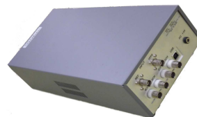
Table 1: Sampling mode of K5/VSSP32 (left) and one unit of K5/VSSP32 sampler(right). The sampler works with any combinations of these sampling parameters within maximum data rate of 256Mbps.