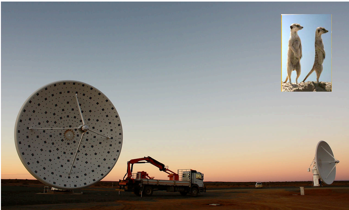
Figure 4 The first two MeerKAT antennae, under construction in the Karoo (insert: meerkats).

If the SKA itself goes to SA the central compact array will be located near Carnarvon, in the Northern Cape, which is an area with particularly low radio interference and will, in future, be protected by legislation (see section 5.1). The exact disposition of the other dishes has yet to be settled, but spreading them throughout Africa, as far east as Mauritius and as far north-west as Ghana, is quite possible.