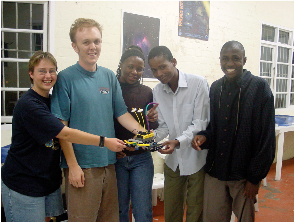
Figure 5 Students at the SAAO NASSP preschool with a robot they have constructed and programmed