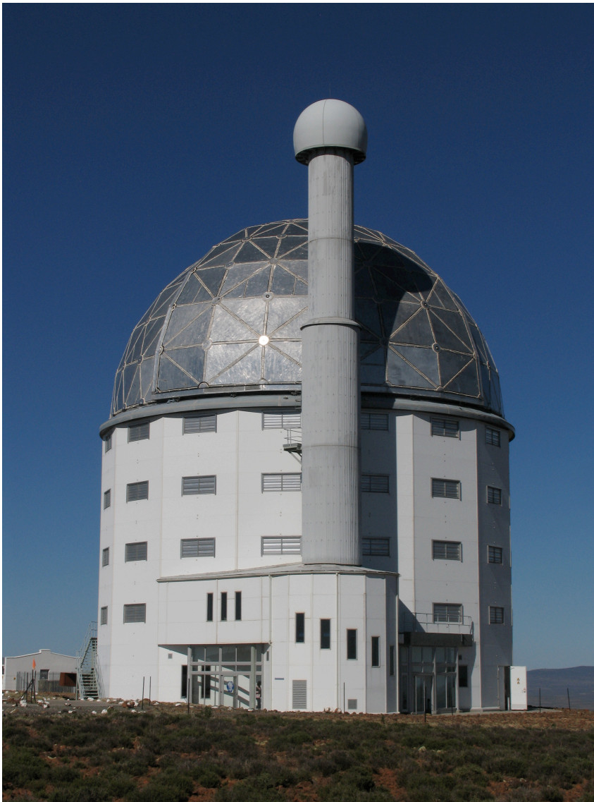
Figure 1 The SALT telescope dome at Sutherland in South Africa

SALT's low cost construction, using a spherical primary and a fixed altitude supporting structure makes it a test-bed for technology that could be used on the next generation of extremely large telescopes [1].