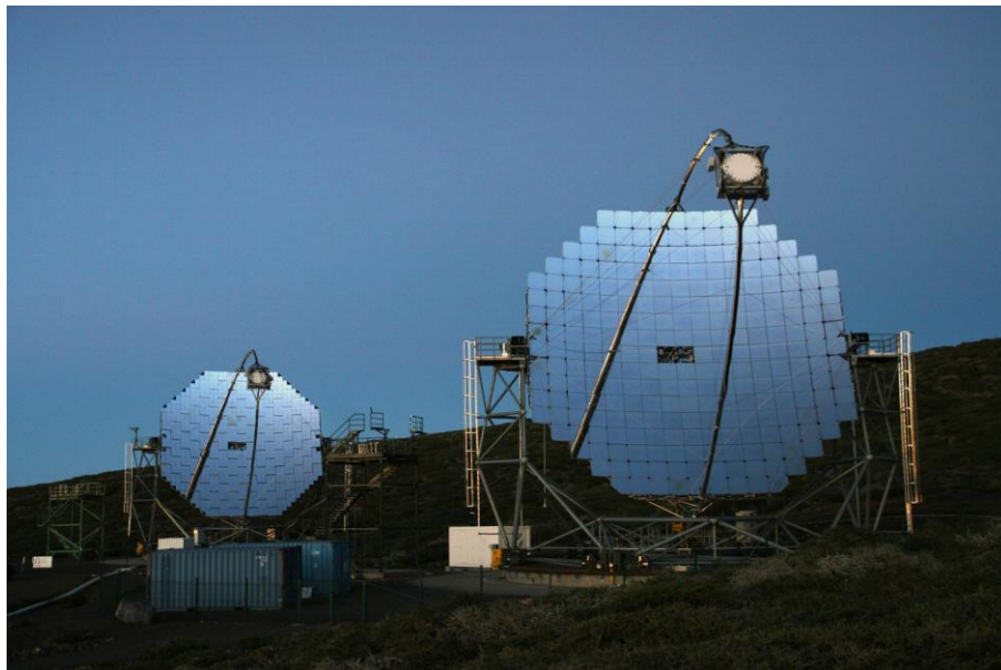
Figure 1: The MAGIC 17m imaging atmospheric Cherenkov telescopes at the Roque de los Muchachos Observatory, La Palma, Spain. Both telescopes are 85m apart.

The most sensitive instruments to observe at Very High Energy (VHE; >100 GeV) are the Imaging Atmospheric Cherenkov Telescopes (IACTs), which detect gamma-rays through the detection of the Extended Air Showers (EAS) induced by the primary gamma-ray in the Earth atmosphere. In this case, the atmosphere serves as a calorimeter, and large effective collection areas of 10^{4-5} m 2 can be achieved. This detection efficiency needs to be compared with that of the Fermi-LAT which is about 1 m 2 . The most advanced IACTs are currently HESS [2], VERITAS [3] (arrays of four \sim 12 m diameter mirror telescopes) and MAGIC [4], [5] (stereoscopic array consisting of two \sim 17 m diameter telescopes). Among all of them, MAGIC is the IACT with the lowest trigger energy threshold (60 GeV), and hence the one that has the largest overlap with the energy range covered by the Fermi-LAT (nominally 20 MeV-300 GeV). In these proceedings we report the discovery of VHE gamma-ray emission from the 1FGL J2001.1+4351, which was observed by MAGIC during summer 2010.