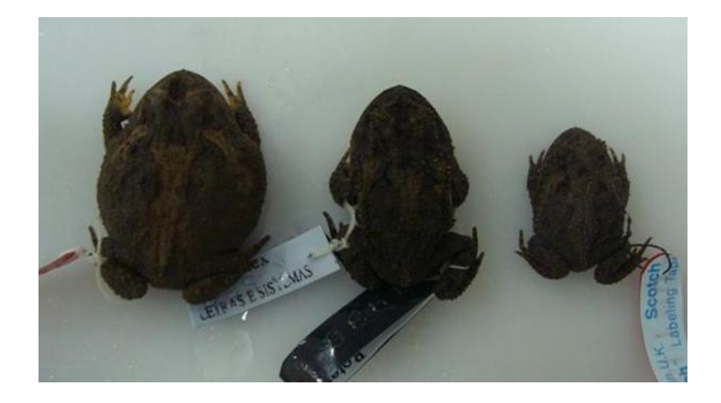
Figure 1. Typical specimens of (from left to right) P. bigibbosa, P. brauni, and P. avelinoi.

After being caught, all specimens were sacrificed using 30% alcohol, then covered with 10% formalin as fixative, and definitively deposited into 70% alcohol for the museum collection. Fig.1 shows the representative specimens of P. bigibbosa , P. brauni and P. avelinoi species. It can be seen that the external morphology of three members of the group is very similar to each other, except for the dimensions.