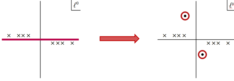
Figure 2: Cutting as contour replacement

the simultaneous solutions to eqs. (4.3), in \mathbb{C}^4 . The contour in the case of the one-loop box is a product of four circles, that is a four-torus T^4 . The replacement is illustrated schematically in fig. 2, with contours \mathcal{C}_{1,2} encircling the two global poles. We stress that this is not a contour deformation leaving the value of the integral unchanged; it is a replacement, changing the value of the integral and ultimately allows us to derive an equation for the coefficient of the one-loop box.