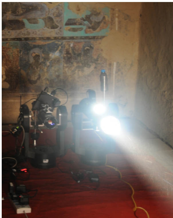
Figure 3: The spectral imaging system PRISMS in cave 465 of Mogao caves, Dunhuang. The imaging system is on the left of the lighting system.