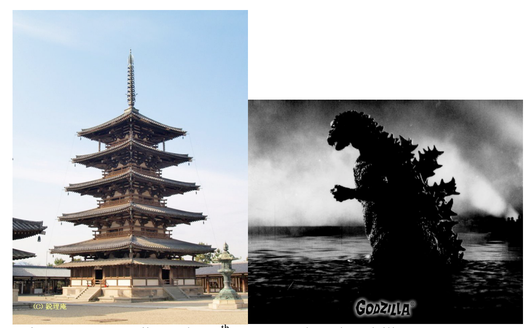
Figure 1. Horyu-ji temple's 5<sup>th</sup> story pagoda and Godzilla.