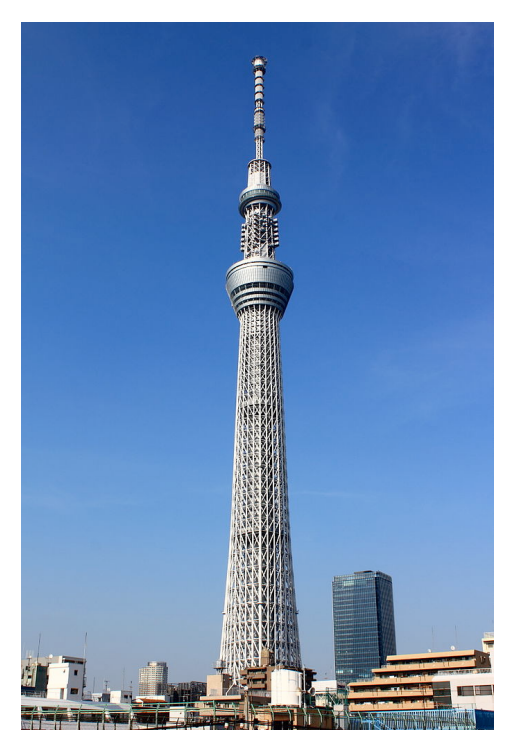
Figure 2. The Tokyo Sky Tree tower (634m), which opened in May 2012.