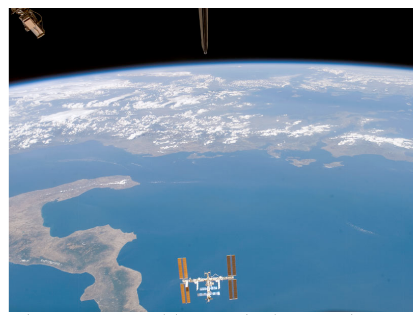
Figure 5. Greece and the International Space Station, as seen from Space Shuttle. The Peloponesse Peninsula and Kerastari is on the right.

One extreme case for achieving very high angular resolution images is space-VLBI, which is the extension of ground based VLBI technology by adding radio telescopes in space. The test experiment was first realized by using a TDRSS satellite combined with Australian and Japanese telescopes in 1986 through 1988. And the dedicated radio astronomy satellite HALCA was launched in 1997 by ISAS to conduct space-VLBI observations. By the usage of the satellite orbit and earth rotation, good coverage of baseline length and orientation can be achieved to generate fine angular resolution images. After successful in-orbit checkouts the VSOP (VLBI Space Observatory Programme) project continued successfully with global collaboration.(Hirabayashi et al., 1998). A tracking station network, world wide ground radio telescopes, correlators, etc. were organized for the project. From Australia, for example, the Tidbinbilla tracking station, and major telescopes joined, and Tasso Tzioumis was an important collaborator during the mission. This was in nature one of the most complex space programs ever tried.