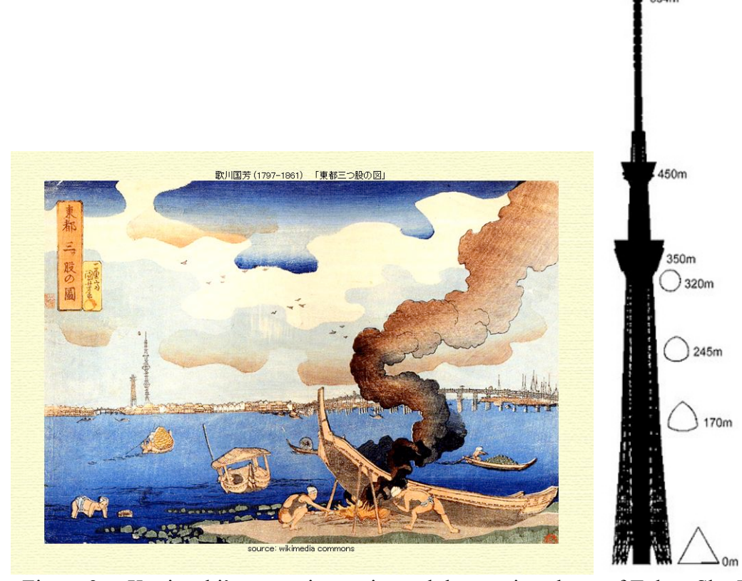
Figure 3. Kuniyoshi's mysterious print and the varying shape of Tokyo Sky Tree.

The shape of the tower has a specific feature of having "triangular" horizontal shape in the bottom to "circular" in the highest part. This makes interesting different shapes from different viewing direction angles. So the tower shape is neither Dorian or Ionian, but some Entasis feature can be seen. (Figure 3.)