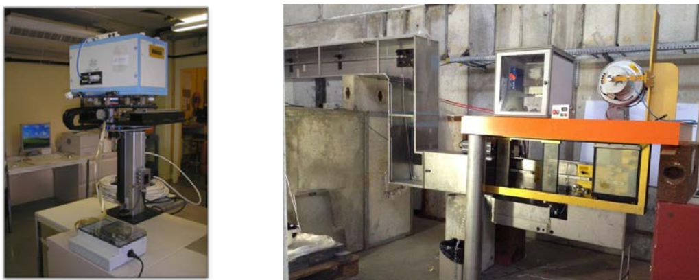
Figure 3: Prototype of a table for proton irradiation equipped with a thermostated irradiation box (left). Loading station of the IRRAD shuttle with its motorization system (picture taken during installation).

On each table, the maximum volume available for irradiation is of 200 \times 200 \times 500\text{mm}^3 while the maximum samples weight is 50kg. The tables can automatically move (e.g. “scan”) the samples during irradiation in order to provide a uniform spot over the 200 \times 200\text{mm}^2 surface (or a smaller portion of it, depending on user request). On these tables, the test of equipment “in operation” (e.g. powered and connected to a DAQ system) is possible as well as irradiation of detector components at low temperature, down to about -20^\circ\text{C} , using specially designed thermostated irradiation boxes (see Fig. 3, left-hand side).