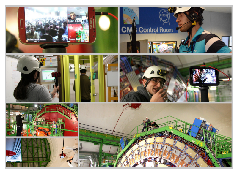
Figure 4: Clockwise from top-left: Mobile camera; CMS guide showing the Control Room; Passing through the iris scan to go 100 metres underground; Showing different angles of the CMS detector placed in its home cavern.