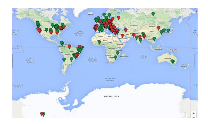
Figure 1: Map of the world showing ATLAS and CMS Virtual Visits connections. Green: ATLAS Virtual Visits; data from Nov 2010 - July 2015. Red: CMS Virtual Visits; data from Sept 2014 - July 2015.

Both teams observed that around 80% of the requests for Virtual Visits to ATLAS and CMS come from local contacts and events developed by the institutes that are part of the collaborations. Others were attracted by the collaborations' outreach programmes.