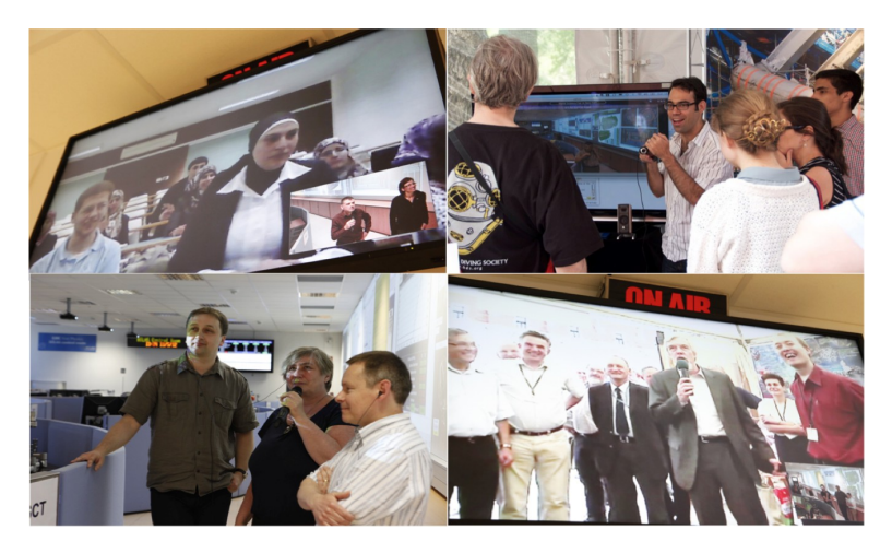
Figure 3: Clockwise from top-left: Visit from Birzeit University, Palestine; Visit from World Science Fair, New York City; CERN Director General.

Over the past six years, the ATLAS Control Room has hosted 227 visits from 40 countries and all seven continents. The project was recognised as "Best Online Event" by the Digital Communication Awards [14] in 2013 and was a finalist for the European Excellence Award in 2014 [15].