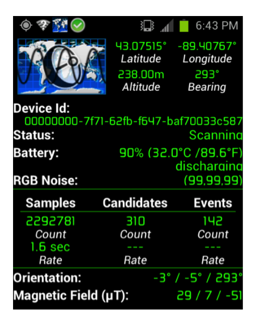
Figure 1: Screenshot of the DECO app.

The DECO app (Figure 1) was released in September 2014 and can be downloaded at [1]. It is currently supported on Android phones running version 2.1 or greater. The app works by taking images with the camera sensor in repeated long exposures. Each image is then analyzed to determine if it is a particle event candidate. For efficient image processing, this occurs in two stages. The first stage is a fast analysis of a low-resolution version of the image. If the image passes this first filter, it is designated a "candidate" and reaches the second stage, which consists of the same analysis applied to a higher-resolution version of the image. Each filter determines whether the image has a certain number of pixels above a certain threshold. For each pixel the analysis is performed on the sum of the red, green, and blue color values. Images passing both filters are designated "events". In addition to the minimum pixel multiplicity requirement, a maximum pixel multiplicity requirement is also enforced in order to ignore images in which light is not sufficiently blocked from entering the camera.