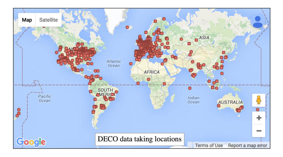
Figure 2: Map of DECO data collection locations. Data have been collected on all seven continents.

The DECO app has been downloaded to thousands of devices of hundreds of different Android models. The distribution of data taking locations is shown in Figure 2. DECO has taken data on every continent (including by scientists at the South Pole).