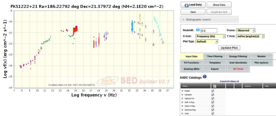
Figure 3: The SED BUILDER tool interface