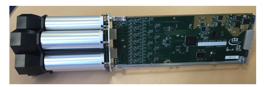
Figure 2: Photo of a PMT Module without the aluminium shielding.

The Camera of the LST shares many elements with the NectarCam [2] proposed for use in the camera on the Medium Size Telescopes (MSTs) of CTA. With a weight of less than 2 tonnes the camera is comprised of 265 PMT modules (see Figure 2) that are easy to access and maintain. Each module has 7 channels, providing the camera with a total of 1855 channels. Hamamatsu photomultiplier tubes with a peak quantum efficiency of 42% (R11920-100) are used as photosensors converting the light to electrical signals that can be processed by dedicated electronics. In addition, we continue to research the possibility of using Silicon photomultipliers [3] in future versions of the LST cameras.