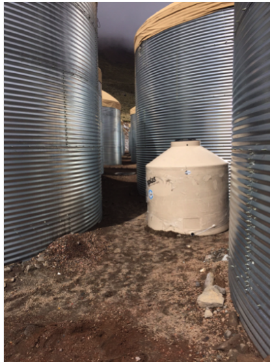
Figure 1: Photograph of some of the 300 WCDs of the HAWC observatory having each 180,000 liters of water. A prototype of an outrigger tank of 2,500 l is also seen.