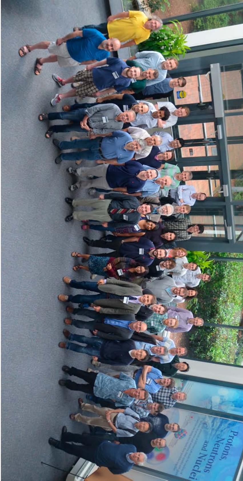
Figure 1: QCD Evolution 2015 Participants