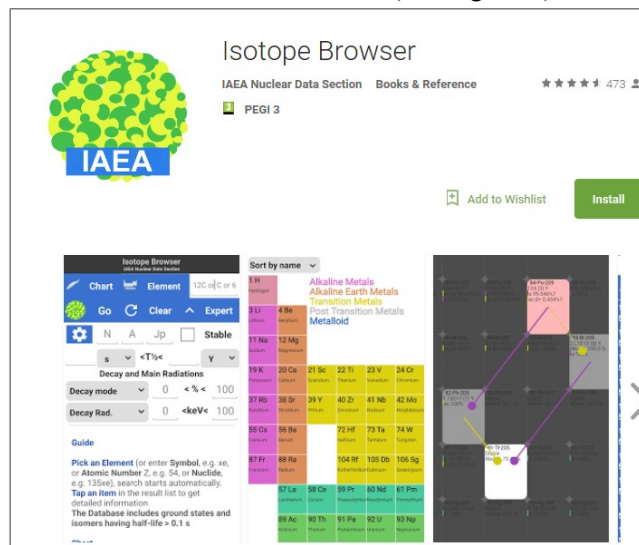
Figure 4. Isotope Browser app for mobile devices.

A further development has been the launching of the Isotope Browser app for mobile devices and tablets. The app gives properties of more than 4 000 nuclides and isomers based on information from ENSDF and is the mobile device version of the LiveChart. A Chart of Nuclides, with zooming and tapping enabled, and a Periodic Table of Elements are included to allow easy selection and navigation. Filter criteria on half-life, decay mode, radiation type and energy can be selected. Summary data are presented in a scrolling list, with a details page for each nuclide containing web links to the data sources and further information. Optimal search-and-retrieve performance is achieved with an embedded database, meaning that no network connection is required. The Isotope Browser can be downloaded from the LiveChart web site, or from Google play, Amazon.com and Itunes web sites (see Figure 4).