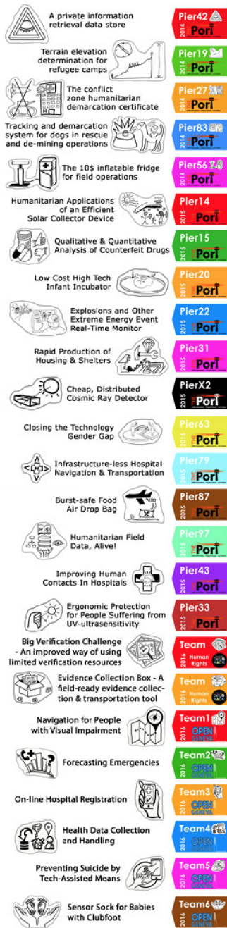
Figure 1: List of the 25 curated challenges in five hackathons with over 300 participants.

THE Port is a curated hackathon that differentiates from classical hackathons by throughout preparation of challenges, teams, mentors and a six weeks preparation phase prior to the hackathon event.