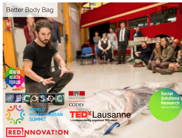
Figure 2: Presentation of the 1st Better Body Bag prototype during THE Port 2014 humanitarian hackathon at CERN and logos of other events it was presented at.

The non profit Social Solutions Research Association (SSRA)[6], an association created by former hackathon team members, currently produces this next generation of body bags for field tests with the ICRC. The cross laminated feature of the used foils increases the puncture and tear resistance. Now the radiation hardness of these foils are tested to improve the performance used for detector environment control systems. The next generation body bags have been shown at many occasions in- and outside the UN environment, e.g. during the first World Humanitarian Summit[7] and the International Tech4Dev Conference [8] at EPFL in Lausanne in 2016 (see Fig. 2).