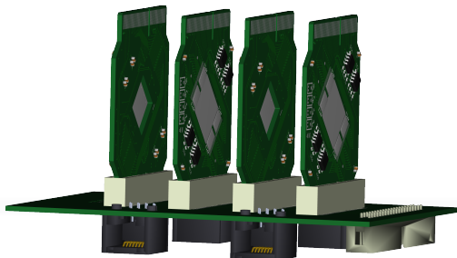
Fig. 1.a: A rendering of the telescope “motherboard” showing four “sensor-cards” each of which holds a single strip sensor. The control signals needed by the readout chip are supplied by a 40-pin header (bottom-right). The data readout happens over four RJ-45 connectors (bottom-center), into which CAT-5 cables are plugged to transmit the signals to the DAQ board.

The telescope has been designed around a specific silicon-strip sensor and accompanying readout chip, both of which were originally developed for the H1 vertex detector at HERA [1]. The strip sensor contains 512 strips with 25\mu\text{m} pitch. The readout chip is the “Analog Pipeline Chip - 128” (APC). Each APC can read 128 strips so four chips are required to read a single strip sensor. The APC operates an integrating pre-amplifier that collects charge from a single sensor strip and keeps a 32-sample history of the output of that pre-amplifier. When a trigger is received from, for example, a scintillation detector indicating a particle has passed through the telescope, the appropriate sample is chosen from the 32-sample history based on the calibrated trigger latency and the selected samples from all 128 channels of the APC are serialized to its output.