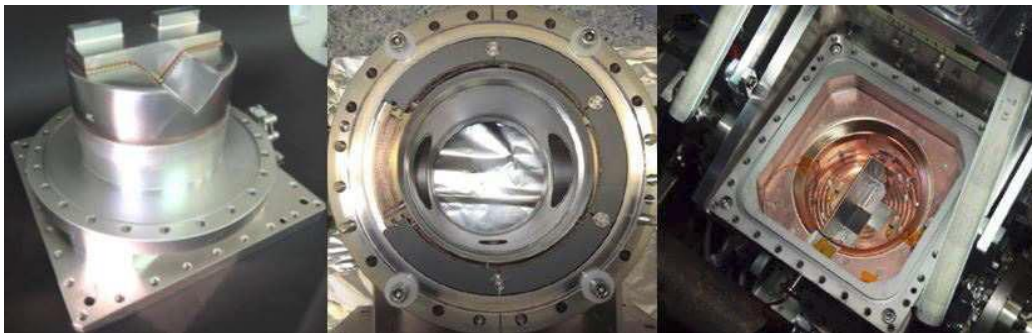
Figure 2. Three modifications to improve the heat protection. From left to right: the RP-filler attached to the bare RP, the ring of ferrites distributed on the RP station flange and the copper heat distribution system with attached temperature probes.

To minimize the RF impact on the temperature four measures were taken. The most important was to reduce the cavity volume, and thereby the RF power deposit, by extending the RP by a so-called RP-filler. In addition, the ferrites were mounted at positions where they absorb the wake fields of the beams in more efficient way, a heat distribution system made of thin copper plates was installed inside the RP and the air cooling was intensified by additional fans and a better streaming to the RP flanges. The three first modifications are shown in Fig. 2.