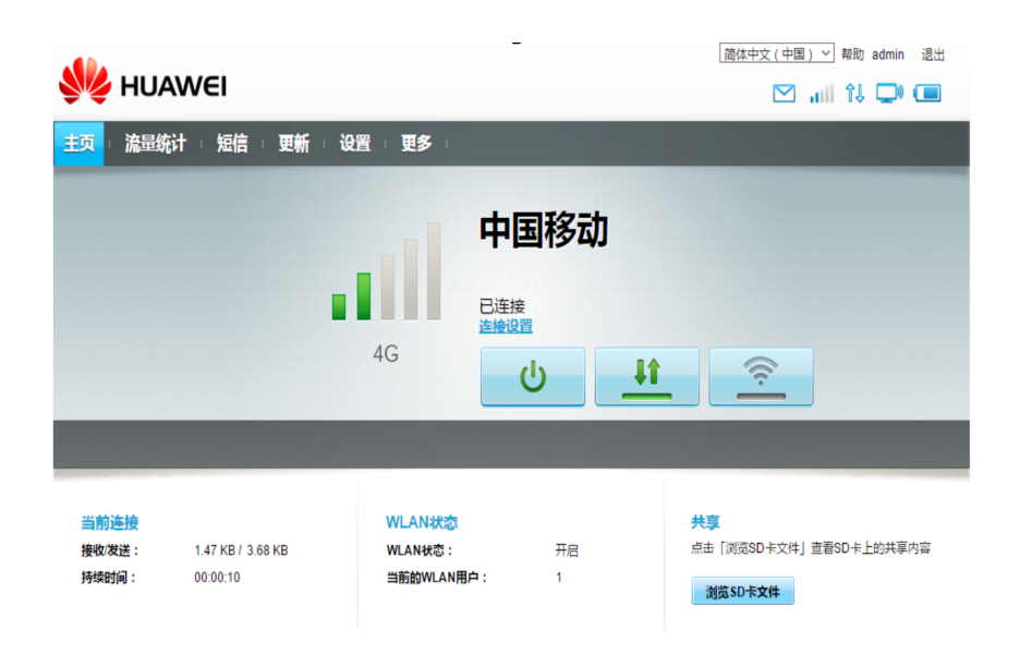
Figure 2: Normal status of Huawei E5573 Mobile Wi-Fi

Chrome OS, iOS, Android, Windows Universal Platform, and Black Berry. Secondly we can start TeamViewer instantly. TeamViewer even works behind firewalls and automatically detects any proxy configuration. Thirdly it has high performance, such as intelligent connection setup and routing, efficient use of bandwidth, fast data transmissions, remote session framerates up to 60 fps, and automatic quality adjustments ensure an optimized user experience. It has other advantages like no configuration, easy to understand and high security. It needs to know that TeamViewer software is also dependent on the architecture of the system. More detailed information on the