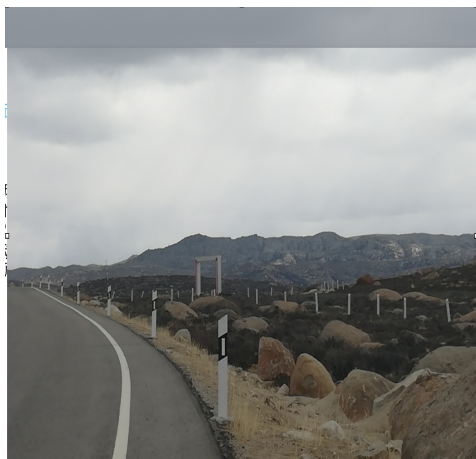
Figure 4: left: Aden Daocheng Airport test site, right: LHAASO base test site

The performance of Sunlogin software in Ubuntu 16.04 linux operating system were tested in the cable network and wireless internet. It is interesting that the internet speed in Mobile Wi-Fi mode is faster than in cable internet mode. The mean values of download and upload speed were 1.071Mbps and 0.122 Mbps in Mobile Wi-Fi mode while the mean values of download and upload speed were 0.404Mpbs and 0.7Mbps according to our records in March 2017.