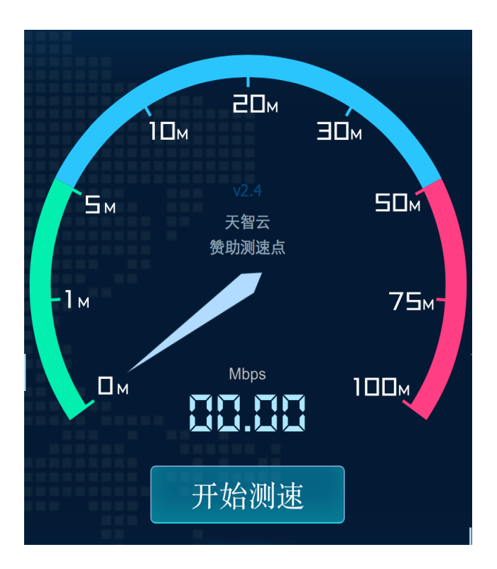
Figure 3: Visual network speed test tool

installation and usage can be found in the paper of [6]