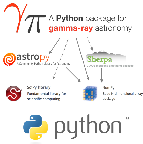
Figure 1: The Gammapy software stack. Required dependencies (Python, Numpy and Astropy) are illustrated with solid arrows, optional dependencies (SciPy and Sherpa) with dashed arrows.

the same approach, to build on Python, Numpy and Astropy. To name just a few, there is ctapipe ( github.com/cta-observatory/ctapipe ), the prototype for the low-level CTA data processing pipeline (up to the creation of lists of events and IRFs); Naima for modeling the non-thermal spectral energy distribution of astrophysical sources [15]; PINT , a new software for high-precision pulsar timing ( github.com/nanograv/PINT ), and Fermipy ( github.com/fermipy/fermipy ), a Python package that facilitates analysis of data from the Large Area Telescope (LAT) with the Fermi Science Tools and adds some extra functionality.