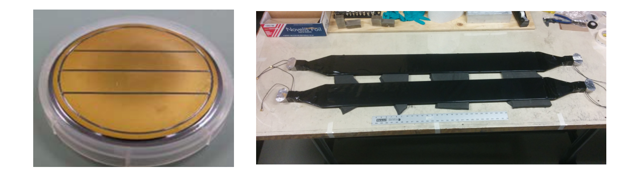
Figure 3: Left: a prototype 4-inch diameter Si(Li) detector with the required geometry for GAPS. Right: A prototype 1.2m long TOF scintillation counter that uses PMTs and light guides.