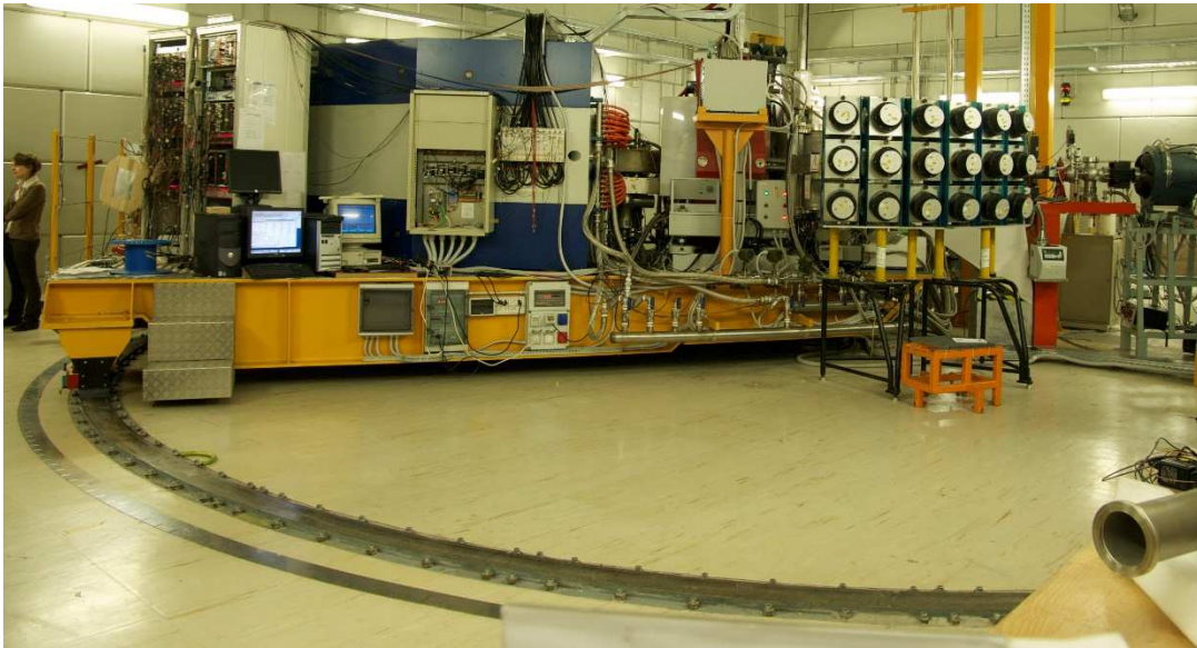
Figure 2. The MAGNEX spectrometer at INFN-Laboratori Nazionali del Sud

Two pairs of target nuclei of interest as candidate for 0\nu\beta\beta will be studied in both \beta^-\beta^- and \beta^+\beta^+ direction: the ^{76}\text{Ge} - ^{76}\text{Se} and the ^{116}\text{Cd} - ^{116}\text{Sn} pair. These targets represent candidates for 0\nu\beta\beta decay and belong to two different classes of nuclei: those in which protons and neutrons occupy the same major shells ( ^{76}\text{Ge} - ^{76}\text{Se} ) and those in which they occupy different major shells ( ^{116}\text{Cd} - ^{116}\text{Sn} ). Moreover, the magnitude of the Fermi matrix element, which is related to the overlap of the proton and neutron wave functions, is different in these two classes of nuclei, being large in the former and small in the latter case. The study of the different behaviour of the nuclear matrix elements in these systems is interesting. These nuclei have been chosen because the transition to the first excited states can be well separated from the ground states by the MAGNEX resolution (being the first excited states at 562 keV for ^{76}\text{Ge} , 559 keV for ^{76}\text{Se} , 1.29 MeV for ^{116}\text{Sn} and 513 keV for ^{116}\text{Cd} ) and also because the production technologies of these targets are already available at LNS.