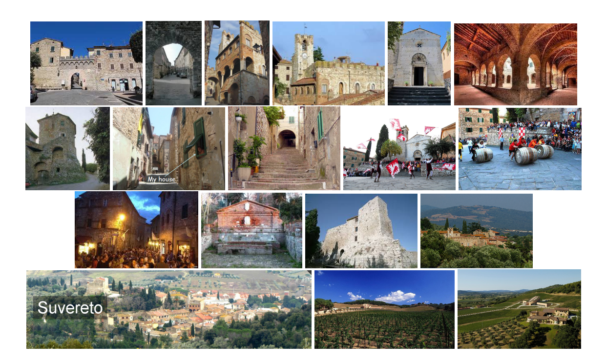
Figure 1: Suvereto. First line, from the left to right: The southern gate "La Porta" (1300 A.C.); The northern gate "La Porticciola" (~ 1300 A.C.); The loggia of judges (XIII Century); The village hall (XIII Century); Romanesque church of San Giusto "Ecclesia S. Justi" (IX-XII Centuries); St. Francis cloister "Il Chiostro di San Francesco" (XII Century). Second line, from the left to right: The tower "Il Torrione" (XIV-XV Centuries); My House (~ XV Century); Great staircase "Gli Scaloni" (~ XIII-XVI Centuries); The flag bearers of the fifteenth century "Gli Sbandieratori"; The Palio of Santa Croce of the barrels. Third line, from the left to right: Goblets of stars "Calici di stelle" (10th August); The source of the angels "La Fonte degli Angeli" (~ 1500); Fortress Aldobrandesca "Rocca Aldobrandesca" (XII Century); Partial panorama of Suvereto. Fourth line, from the left to right: General panorama of Suvereto; PETRA Vineyard in San Lorenzo (hamlet of Suvereto); PETRA Olive grove in San Lorenzo (hamlet of Suvereto). These two last photos show a part of the farm built by my great-grandfather Francesco and belonging to Giovannelli's family until 1961.

Suvereto became, thanks to Ildebrandino VIII of the Aldobrandeschi, the first free municipality of Tuscany, with the issue of the "Charta Libertatis" in 1201, October 14th, which granted freedom of trade and government to the inhabitants of the town. It is from this period the construction of the "Palazzo Comunale" (village hall) with the loggia of judges ("Loggia dei Giudici"), where disputes between citizens were resolved. Baroncello, the first mayor of Suvereto elected by the people for treating with Ildebrandino VIII Aldobrandeschi, Count Palatino, the "Charta Libertatis". This important historical event is celebrated each year on December 8th in occasion of the "Sagra di Suvereto" (Suvereto Festival) after the historical cortege.