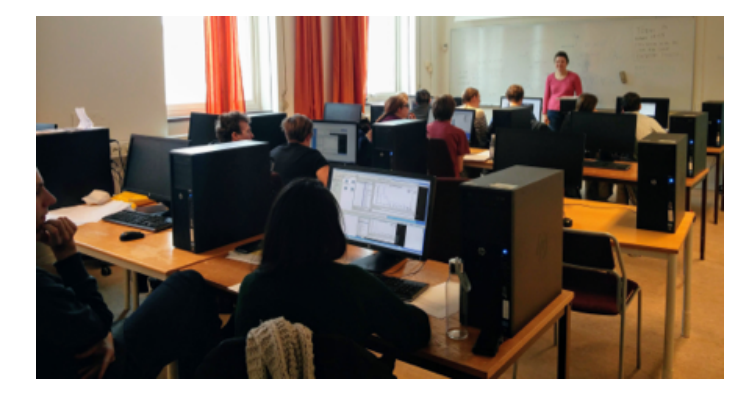
Figure 3: Picture from a laboratory session from the Modern Experimental Particle Physics course at Lund University.

At Lund University (Sweden), we use the ATLAS Open Data for hands-on data analysis in the Modern Experimental Particle Physics course. Modern experimental particle physics at Lund University is a course for students that have already a basic knowledge of particle physics, usually taken by students who are currently or will soon be doing their Master's or Bachelor's project at the Particle Physics Division. Most of the students are already familiar with basic programming (e.g. Python).The aim of the course is to bring the students up-to-date with contemporary particle physics and the status of the Standard Model from the experimentalist's point of view. It also includes a basic introduction to the statistical methods used. An important part of the course is the reconstruction and identification of particles as well as understanding the analysis strategies, and the ATLAS Open Data plays an important role in introducing the students to all those concepts.