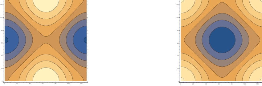
Figure 2: Real and imaginary parts of the eigenvalues of S after contour rotations for fields and small time rotation. Hot colors correspond to larger eigenvalues.

Ideas presented in detail for the harmonic oscillator may be adapted to systems with infinitely many degrees of freedom without much trouble. We start from the lattice action for a complex scalar in d = 1 + 1 , S[\phi] = \frac{a^2}{2} \sum_{x,\mu} (\partial_\mu \bar{\phi}_x \partial^\mu \phi_x - m^2 \bar{\phi}_x \phi_x) , where \partial is the forward lattice derivative. Indices are raised and lowered with the Minkowski metric \text{diag}(1, -1) . Fourier transformation followed by a rotation of integration contours and inverse Fourier transformation leads to the action