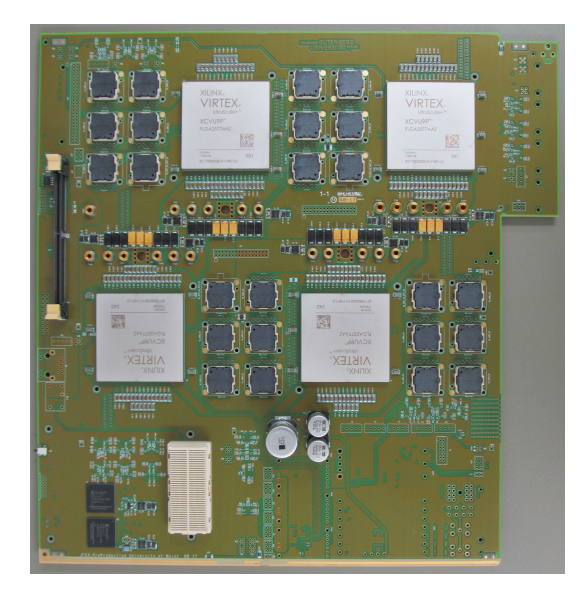
(a) jFEX prototype.

The jFEX system is going to replace the Jet / Energy Modules (JEMs), which were mainly responsible for jet identification inside the Level-1 Trigger during Run-1 and Run-2. To cover the full calorimeter, the entire jFEX system runs on 6 ATCA boards (modules). 4 Xilinx UltraScale+FPGAs for processing and an Avnet UltraZed EV board as a control mezzanine are placed on each module. A picture of the jFEX prototype is shown in Figure 2a.