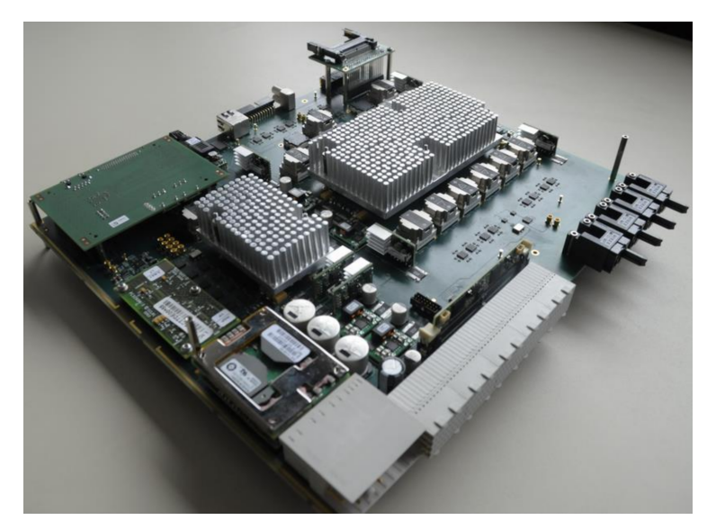
Figure 1: L1Topo Module during Run-2. The FPGAs are covered by heat sinks.

The L1Topo system during Run-2 consists of 2 ATCA boards (modules). Each module hosts 2 Xilinx Virtex-7 FPGAs for event processing and 1 Xilinx Kintex-7 FPGA for control and readout. A picture of the L1Topo module is shown in Figure 1.