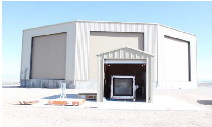
Figure 1: The EUSO-TA detector in front of the Black Rock Mesa Fluorescence Detector station.

EUSO-TA [1, 2] is one of the experiments of the JEM-EUSO program [3], born and used to validate the observation principle and the design of this kind of detectors by observing EASs and laser pulses from ground. It is installed at the Telescope Array (TA) [4] site in Utah (USA), in front of the Black Rock Mesa Fluorescence Detector (BRM-FD) station [5], as shown in Figure 1. With the external trigger provided by the BRM-FDs, it is possible to detect EASs and pulsed laser shots from the Central Laser Facility (CLF) [6], at about 20 km distance, which can be used to test and calibrate the detector. In addition, portable lasers with variable direction and energy, like the Global Light System prototype (GLS) [7], can be used to extend the range of distance of the source from the detector. The EASs detected by EUSO-TA have been analyzed to understand the performance and the detection limit of EUSO-TA. In this proceedings, updates with respect to the analysis discussed in reference [1] are given.