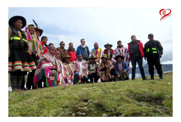
Figure 6: Inhabitants of the Sibinacocha region welcomed the possibility of installing SWGO detectors at the Sibinacocha lake. The picture was taken next to the Sibinacocha lake with local authorities and community leaders.

The "Alcalde" of the district of Pitumarca, which is the district where the Sibinacocha lake is located, also offered complete support for installing particle detectors at the Sibinacocha Lake. The "Alcalde" informed the locals about the SWGO project and they welcomed this possibility (Fig. 6).