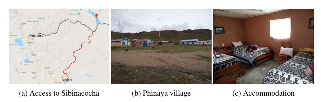
Figure 3: (a) There are two access road to Sibinacocha Lake, one via Pitumarca and the other via Sicuani. (b) The small town of Phinaya is only 10 minutes driving from the Sibinacocha Lake. (c) There is a tourist accommodation in Phinaya.

There are two access roads to Sibinacocha lake, one via Pitumarca and the other via Sicuani as seen in Figure 3(a). Both are about 80 km long of unpaved road, but because of the characteristics of the road, the road via Sicuani is faster, it is about 2 to 2.5 hours driving, compared to 3 hours via Pitumarca road.