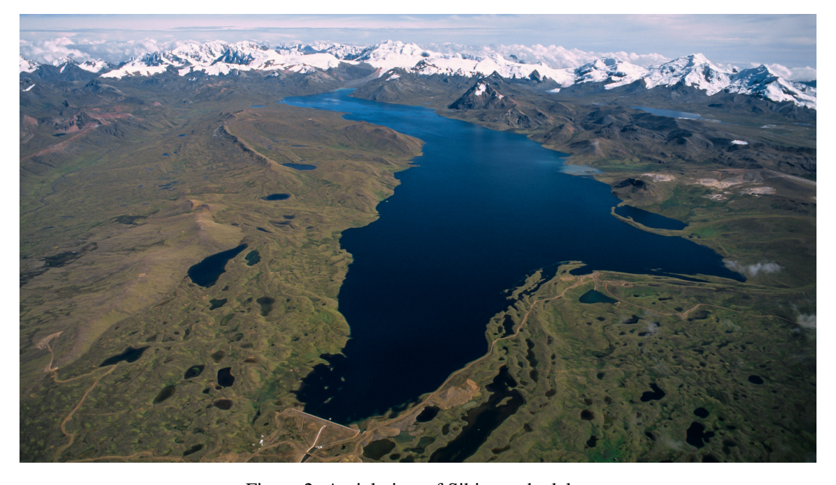
Figure 2: Aerial view of Sibinacocha lake.