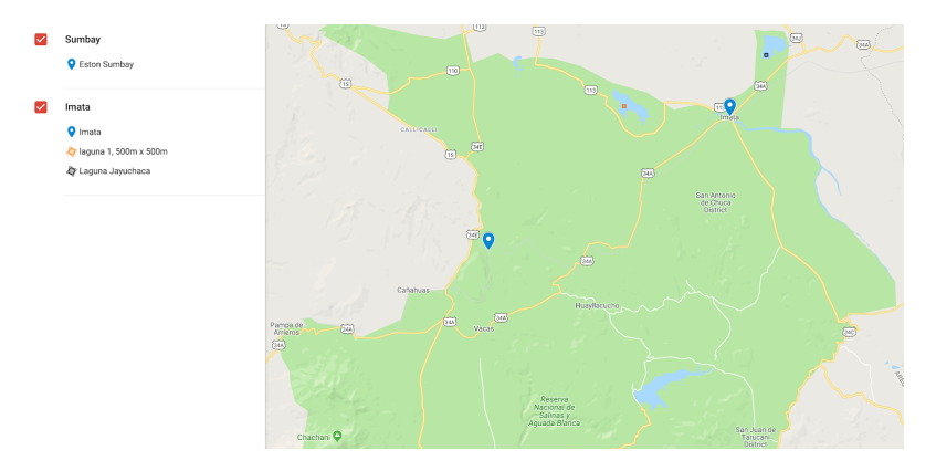
Figure 4: Map showing the sites of Sumbay and Imata. There are two lakes available in Imata. The small squares drawn in the Imata lakes show the dimensions of 500m x 500m.

The Imata site is located next to the Imata town, which is used as a stopping point for truck drivers. This site has two lakes and large flat areas that can also be used to extend the ground array. It also takes about 1.5 hours drive from Arequipa over a paved road in excellent conditions. The squares drawn inside the Imata lakes in figure 4 indicate the size of 500m x 500m, which is the proposed size for the SWGO ground array.