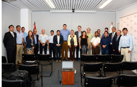
(a) Meeting at the University in Arequipa