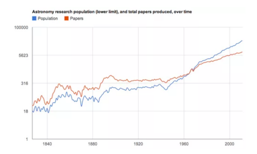
Figure 2: The number of astronomical papers (red line) and publishing astronomers (blue line) per year vs. year. Note the logarithmic scale on the y-axis.

journals. If I consider only AAS journals, A&A and A&AS, MNRAS, PASP, and PASJ the fraction of never cited papers gets much smaller, i.e., 1.3% (159/12568).