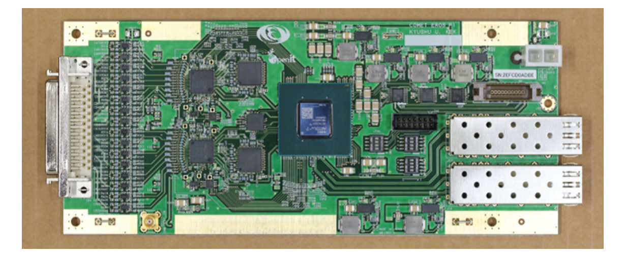
Figure 2: Semi-final version of EROS.

Semi-final version of the prototype of the ROESTI was developed and evaluated. As for FPGA, Artix-7(Xilinx) was adopted. As for other parts, radiation tolerant parts were adopted except for regulator, DAC, and SFP which is changed in next version based on the irradiation tests. Fundamental performance evaluation was done and the performance satisfied the requirements from physics [7]. Design of the final version is ongoing.