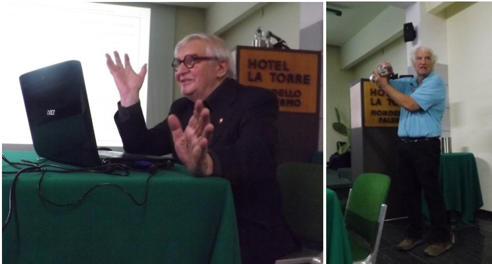
Figure 5: Speakers.