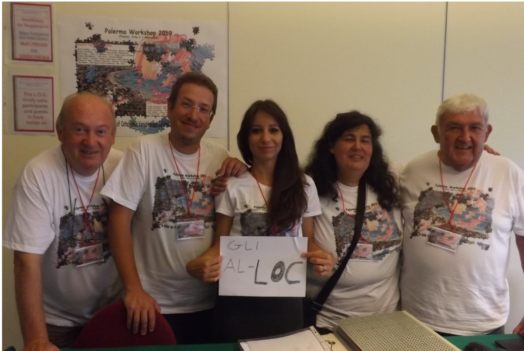
Figure 1: LOC of the conference.

In my opinion, the following selected pictures taken during the conference will better illustrate the scope, atmosphere, and success of the conference The Golden Age of Cataclysmic Variables and Related Objects V better than any more words.