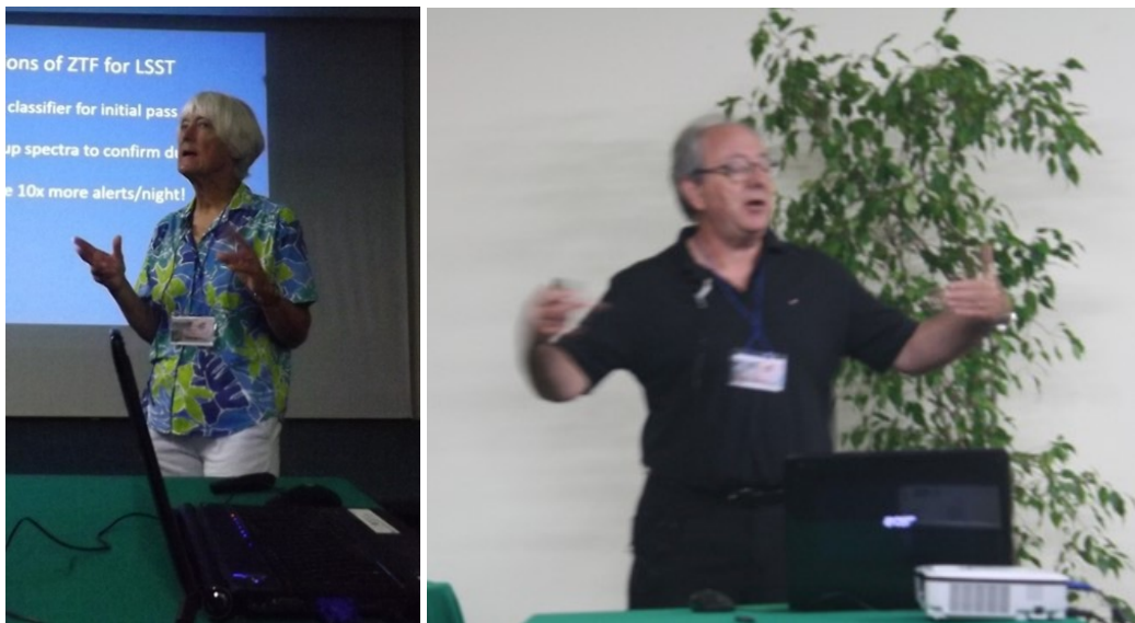
Figure 11: Another speakers demonstrating sizes of their accretion discs...