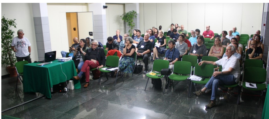
Figure 3: Conference session.