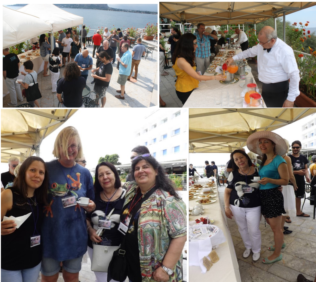
Figure 8: Coffee breaks with delicious Sicilian coffee.

H2020 project AHEAD funded by the European Union as Research and Innovation Action under Grants No: 654215 and 871158.