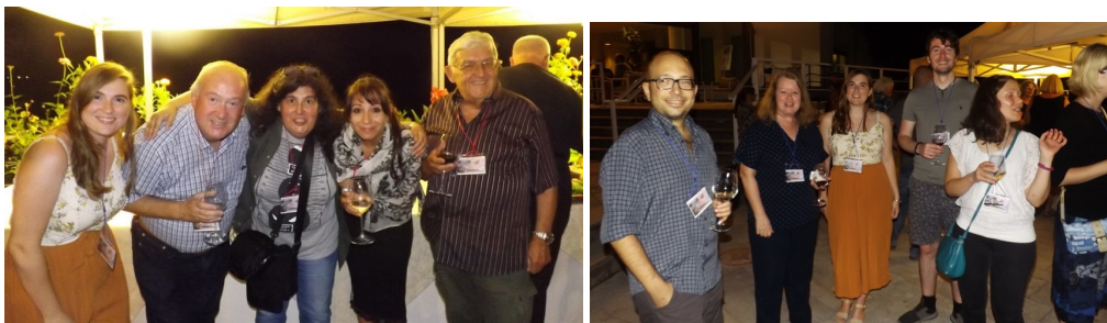
Figure 7: Etruscan wine party.