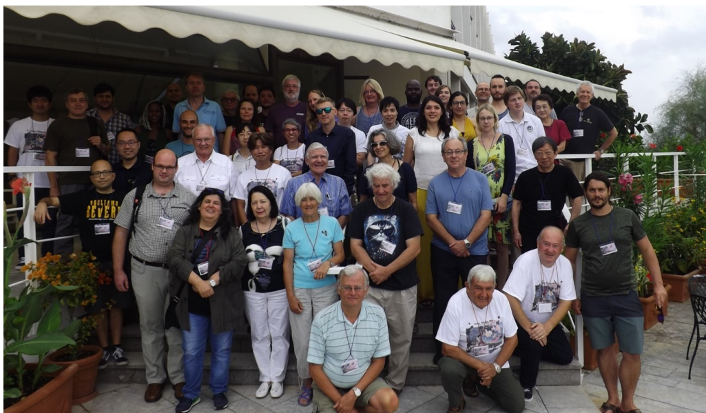
Figure 2: Conference group photograph.