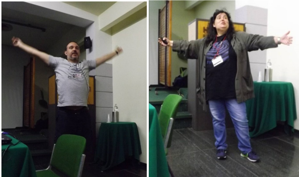
Figure 10: In this conference, quite numerous speakers have illustrated the size of accretion disc in their models, in some cases even in rotation (left).