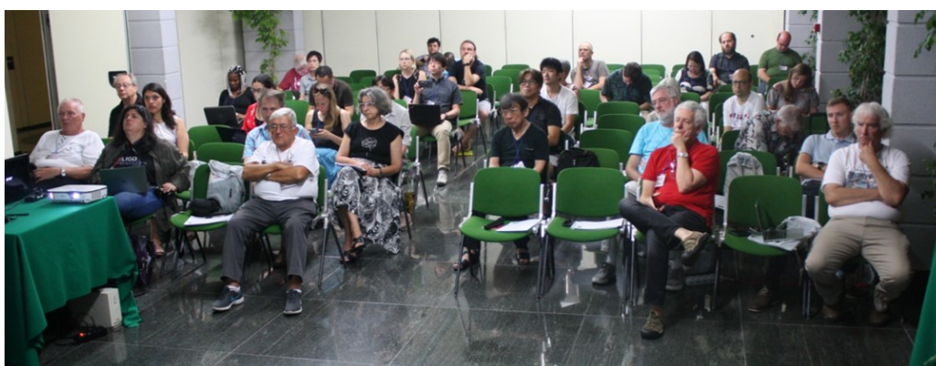
Figure 4: Conference session 2.