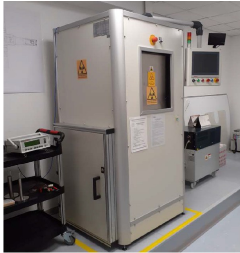
Fig. 3.1: The TIFPA-INFN x-ray irradiation cabinet in the Povo site laboratories.

In the TIFPA-INFN laboratories of the Povo site, irradiations can be performed also with an x-ray source because are equipped with a Comet 3KW x-ray tube housed in a Xstrahl cabinet.