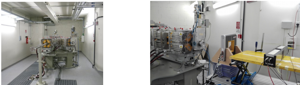
Fig 2.1: The two beamlines during the commissioning (left) and the thirty degree beamline during a test-beam (right).

In the experimental cave of the experimental area two almost identical beamlines (called zero degree and thirty degree beamline) are available for in air experiments, test and irradiations. For practical reasons the zero degree is used mainly for biological experiments, while the thirty degree line is used mainly for physics activities.