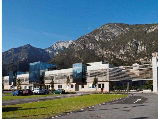
Fig. 1.1: The Trento Proton Therapy Center.

Proton irradiation are performed in the experimental area of the Trento Proton Therapy Center (TPTC)[3], that is a medical facility for hadron therapy located in Trento (Italy) and operated by the Azienda Provinciale Servizi Sanitari (APSS)[4].