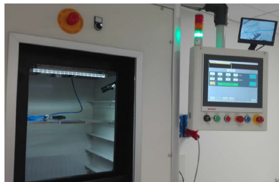
Fig. 3.2: The x-ray shielded irradiation volume. The x-ray tube is located on the top of the irradiation volume.

The tube is realized with beryllium window and a tungsten anode where the anode voltage can be regulated from 195kV down to 30 kV, this allow to switch from tungsten K-alpha, K-beta to L-alfa, L-beta emission peaks in the x-ray spectrum.