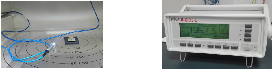
Fig. 3.3: The x-ray dose measurement system composed by a calibrated Farmer Chamber probe (left) and a PTW electrometer(right).

for biological irradiation on cells cultures but, due to its flexibility, since late 2019 is also used for irradiations on SiPM (designed in FBK[12]) for TID damage studies.