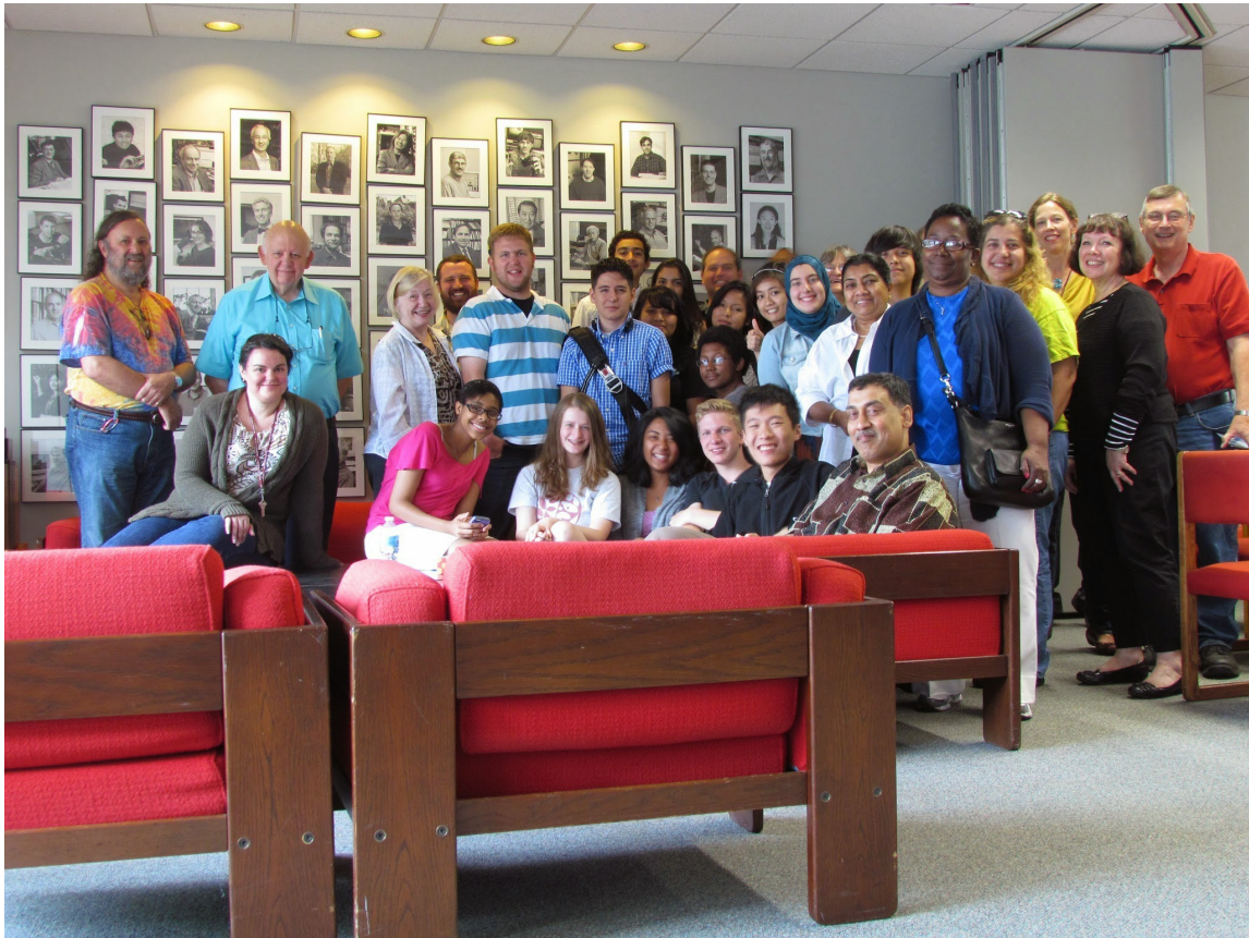
Figure 3: A picture (taken by me) showing the group at the NASA summer program of July 2013. This image shows all organizers, the CPS teachers, students, and the course evaluators. That's me in the front in the brown shirt. I literally had to jump over the couch after setting the 10-second delay timer to take the photograph (but this ensured that everyone is smiling :))

Students met and interacted with some of the experts responsible for the lessons. According to their blogs, they really enjoyed this aspect, since they got to interact with leaders in the field and personally ask them questions. The lessons themselves need to be at an appropriate level. The students would comment on the day's lessons in their blogs, so if something was not up to standard, it was quickly brought to our attention. We suggest that writing of daily blog posts should be encouraged, and an appropriate blogging medium set up.